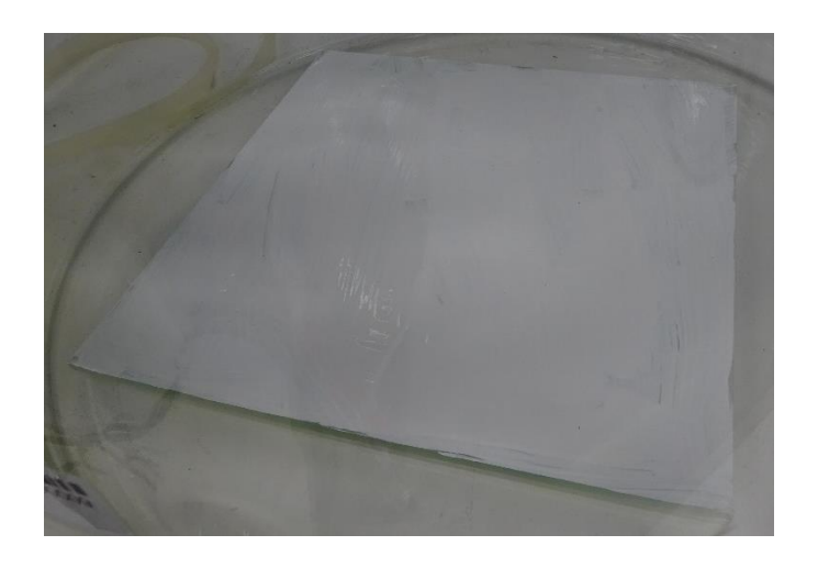
Photograph 1: test sample 89104 Copperant Altra Muurverf