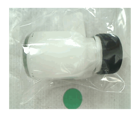
View of content (1mm x 1mm scale)