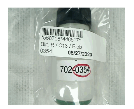
Package received - labeling COC

Atmospheric adjustment factor (REF) 100.0; = pMC/1.000