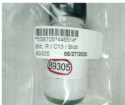
Package received - labeling COC

Laboratory Number Beta-558705 Percent modern carbon (pMC) 47.81 +/- 0.17 pMC Atmospheric adjustment factor (REF) 100.0; = pMC/1.000