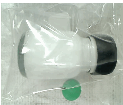
View of content (1mm x 1mm scale)